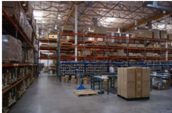
As part of an extensive internal communications and education program, employees are trained on ingredients and product background as a requisite part of the business.