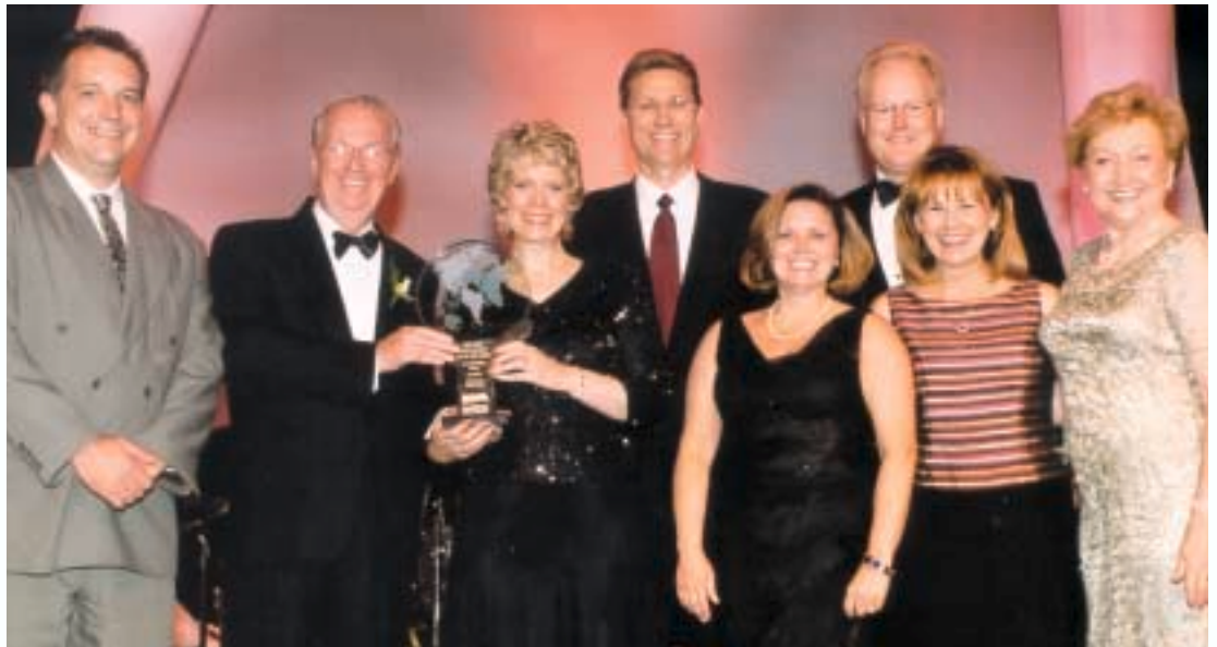
The staff of Case, Huff & Associates, along with BOMA dignitaries, accept the 2003 International TOBY Award.

International Office Building of the Year Water Cost Savings New Brookstone Web Site BOMA Member of the year Tenant's Corner Fire Drill