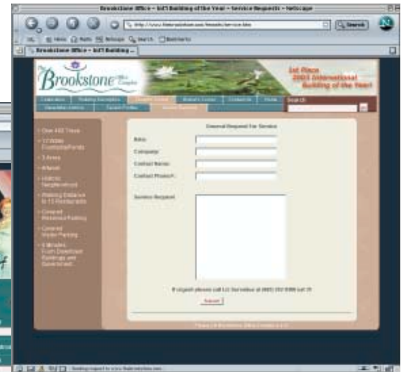
Tenants will especially appreciate their own section of the Brookstone Web site. Tenant directory, newsletter downloads and an online Service Request page are available 24/7 in the Tenants' Corner area.